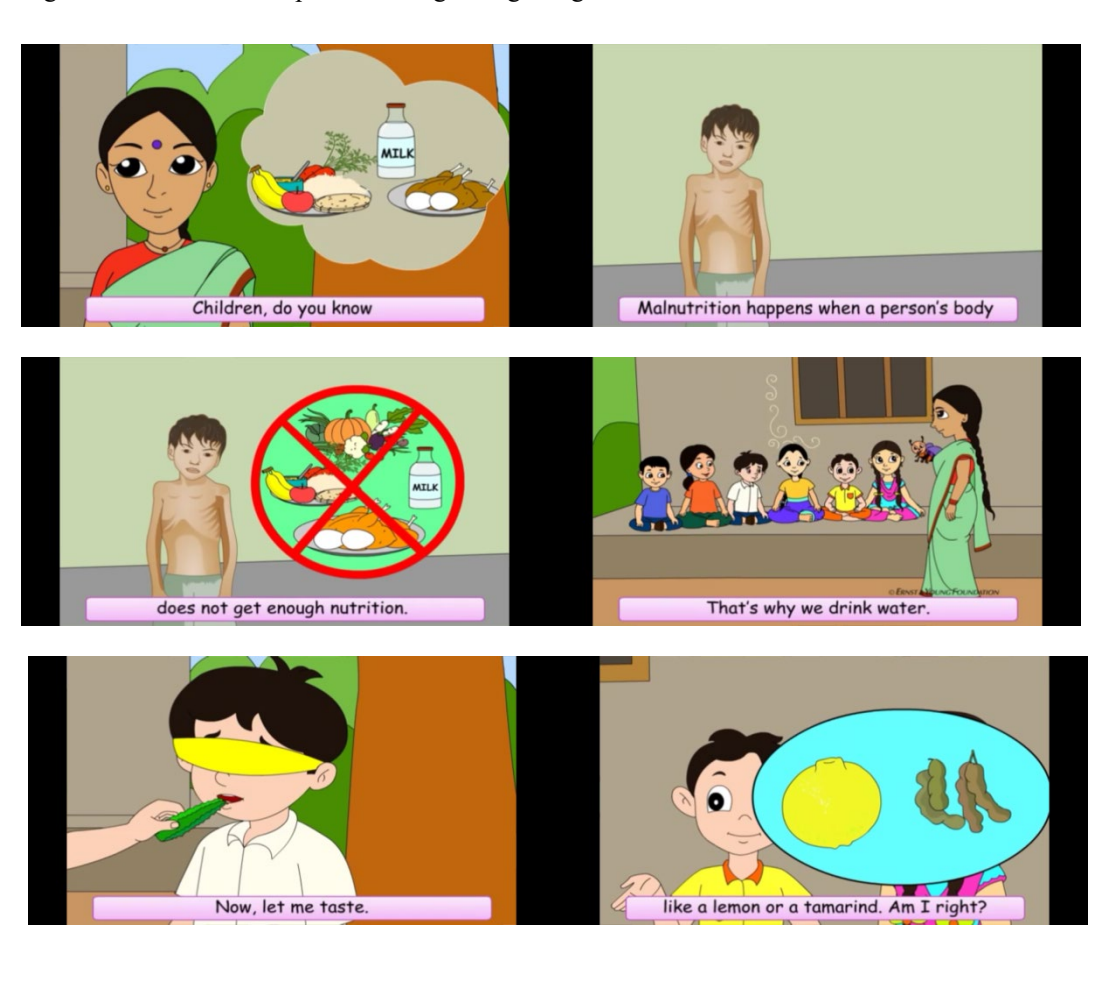
Fig1- series of cartoon clips of "Tasting to Digesting"