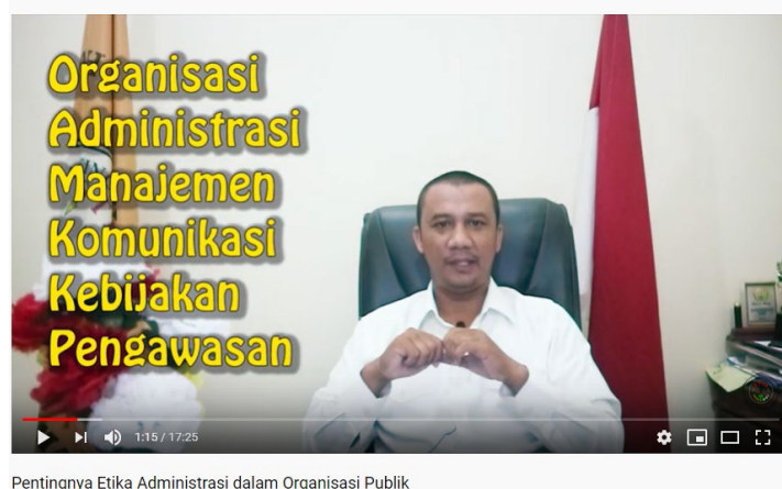
Figure 2. A sample of video-recorded lecture

The flipped classroom instruction was implemented throughout the semester of study (January 2019 - May 2019) as a way to observe students' perceived competence, relatedness, and autonomy and the progress in their learning activities. In its practice, out-of-class activities are as follows: online video lessons prepared and distributed to students, the students watched video lectures online asynchronously and were required to take notes. All video lectures were recorded and distributed to students' learning before class (See Figure 2).