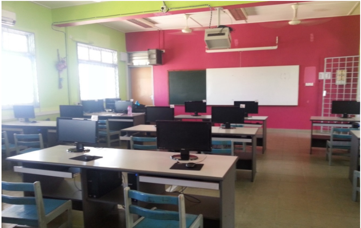
Figure 4.3. The Computer Classroom at Mentakab Primary Tamil School