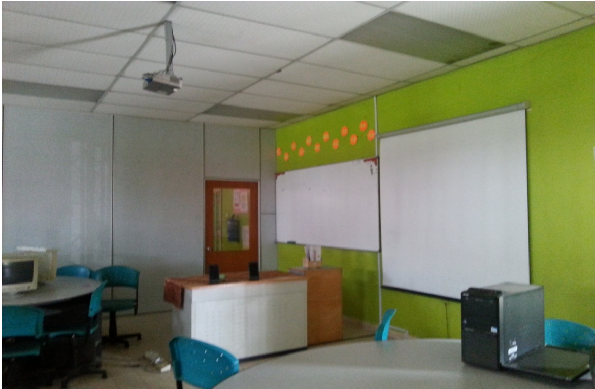
Figure 4.1. The computer lab at Mentakab Primary Tamil School