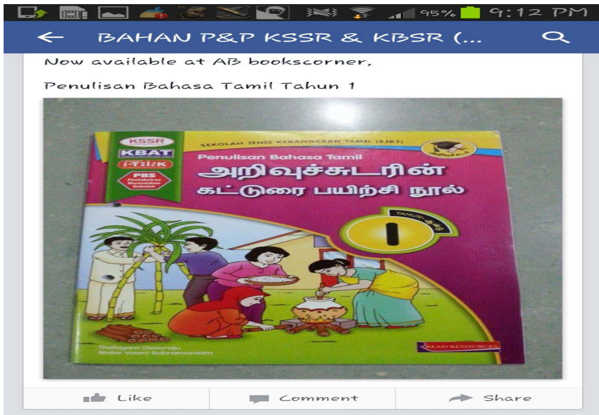
Figure 4.6. Examples of Facebook surfed by teachers from colleague to share reference book