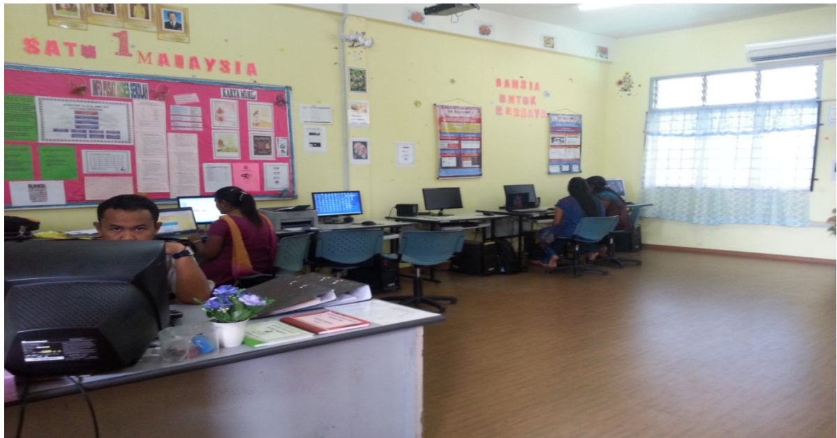
Figure 4.2. The Teacher Computer Access Room at Mentakab Primary Tamil School