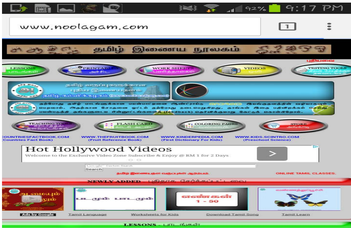
Figure 4.4. Example Of Tamil Website are used as Teaching & Learning Material