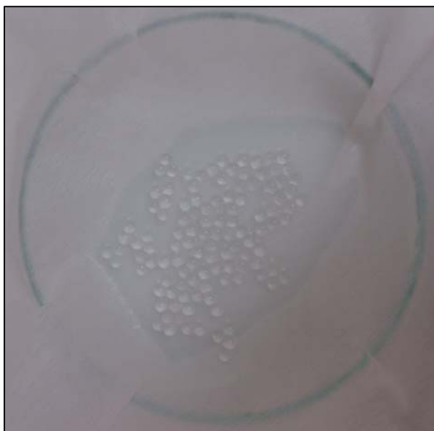
Figure 1. Alginate beads produced by 2% alginate and 50 mM Ca 2+